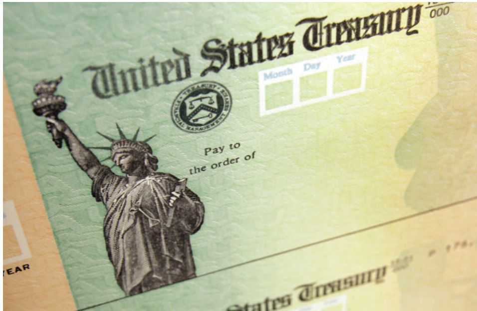
Blank U.S. Treasury checks

D.C. and more than a dozen states are shunning paperless refunds to avoid being conned out of hundreds of millions of dollars.